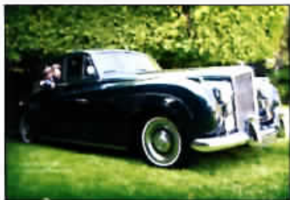
1957 Bentley S1 Saloon (B31GLEG) Excellent touring car. Left-hand drive.

Always garaged. 80,931 miles Redondo Beach area.