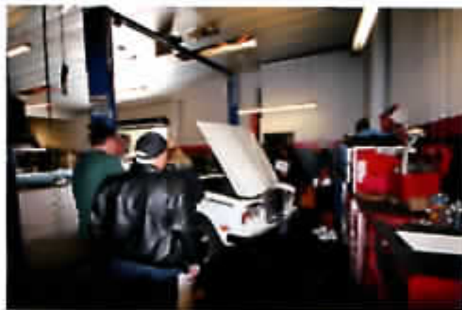
Seeing actual examples for judging.

Please mark your calendars for this wonderful event. See you in Sylmar.