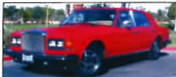
1987 Bentley Eight (SCBZE02A7HCX20777)

In a California collection until eight years ago, this tomato red classic with original paint and in mint condition has covered 17,000 miles total. "Big Red" is a pleasure to drive, turns heads and will make you smile. A first-rate car at an excellent price.