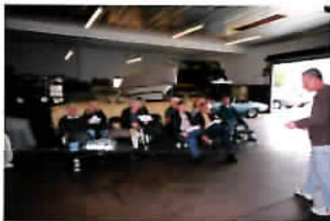
Judging seminar attendees.

The Fox has been spotted in Seal Beach recently as he prepares to outfox his hunters on November 18th. The lunch location has been arranged and we will be breaking bread at a very enjoyable location that shall remain secret.